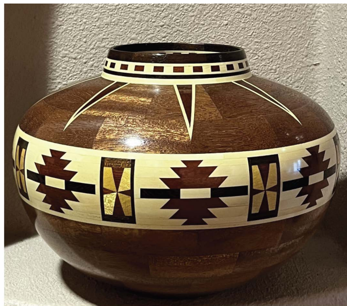
11th Annual Juried Art Show "Enchanted New Mexico"