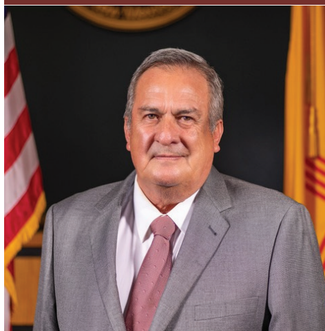
Mayor Charles Griego