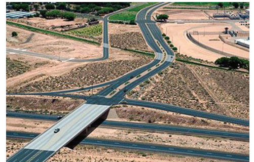
New interchange as seen on NMDOT website.

A New Mexico Department of Transportation website announcement says the proposed location for this new roadway, named the Morris Road alignment, is about 1.5 miles to the south of NM Hwy 6.