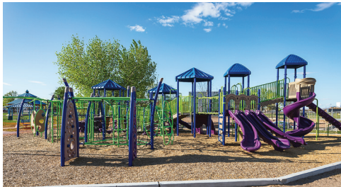
Playgrounds are open.

Remember to sanitize hands before and after use.