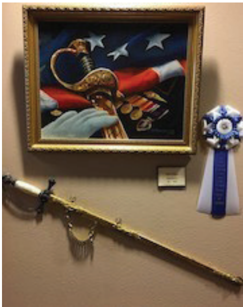
Best of Show Juried Art Show

Village Administration Office: 505 839-3840