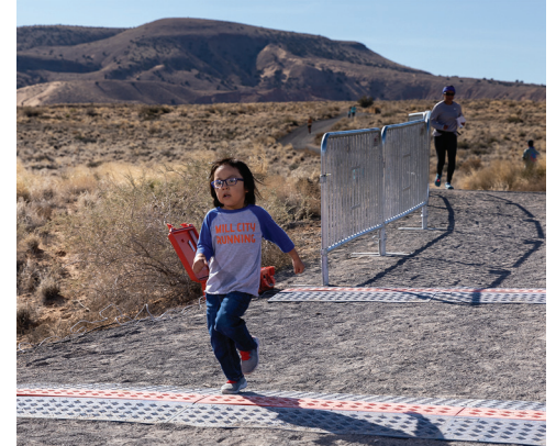
King of the Hill has runners of all ages.