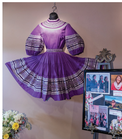
Wonder Women held its Grand Opening in March.

The museum is usually open 10 a.m. to 5 p.m. Tuesday through Saturday.