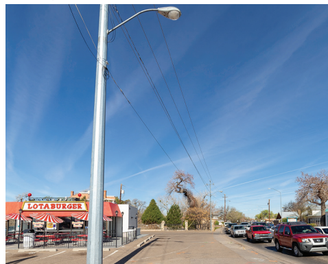
These parking spaces are now a driving lane for turns onto NM HWY 314 at Blake's Lotaburger.

Sundance Mechanical & Utility Corp is installing an 18-inch water line that will serve the future Central Rail Park and future residential and/or commercial development off NM HWY 6 on the west side of the Village. Sundance was low bidder at $357,057.