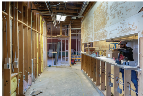
Henrietta's being remodeled to become the Range Café.

For more about what's happening in economic development in Los Lunas visit acomunitythatworks.com .