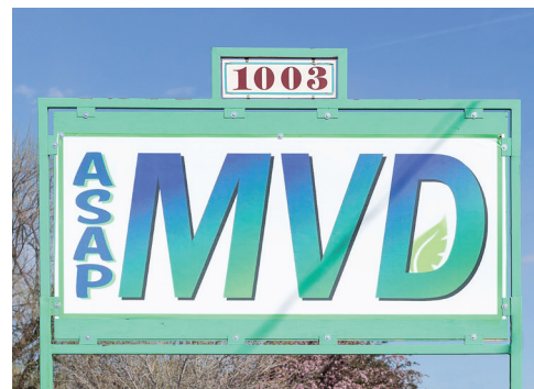
ASAP MVD now open on west side.

ASAP MVD is a family run business that offers an alternative to people who want to get motor vehicle projects done in a timely fashion.