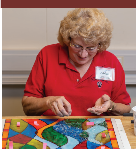
A volunteer works on window treatment made from recycled glass.

Pastel Society Signature Show Through Nov. 3