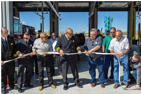
The uncoupling of the hose is the ribbon cutting at the grand opening of Fire Station #2.

Fire Station #2 and the ladder truck were made possible by Village voters approving a general obligation bond issue in March 2016.