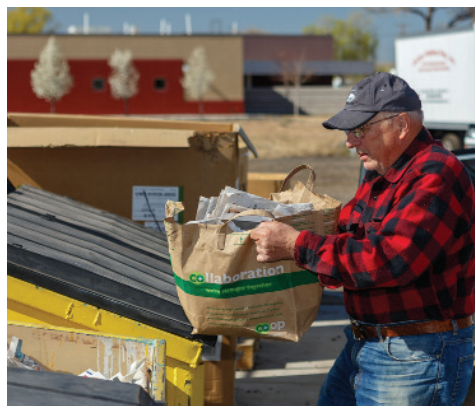
Recycle at 315 Don Pasqual NW

The Village recycling center accepts cardboard; paper; plastics 1 to 7; aluminum; tin; metal; white goods; glass (no windows or florescent bulbs); and electronics.