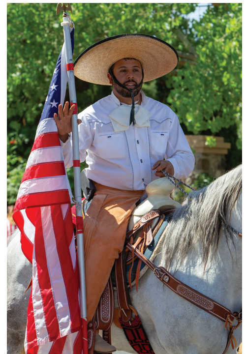
Enjoy the 4th of July parade in the morning.