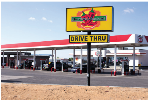
A 5th Burritos Alinstantiate is now open at Kicks 66.

Burritos can be filled with eggs, bacon, chorizo, carne adovada, steak, ground beef, chicharrones, chicken, and/or potatoes. And there's the beans, cheese, and red or green chile too.