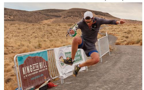
King of the Hill participant celebrates his finish.