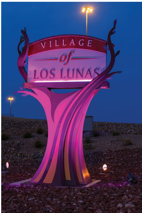
This sculpture at I-25 welcomes people to Los Lunas.

The Village has the second-best rate compared to the other nine places in New Mexico with the 16.6% tax rate.