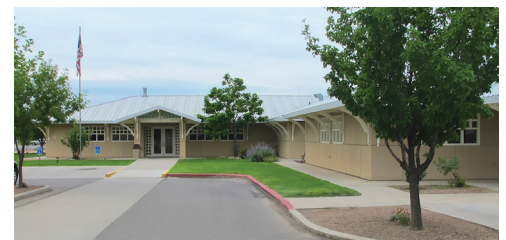
Fred Luna Center is being renovated.

The project is 100% funded through Capital Outlay from the Aging and Long Term Services Department.