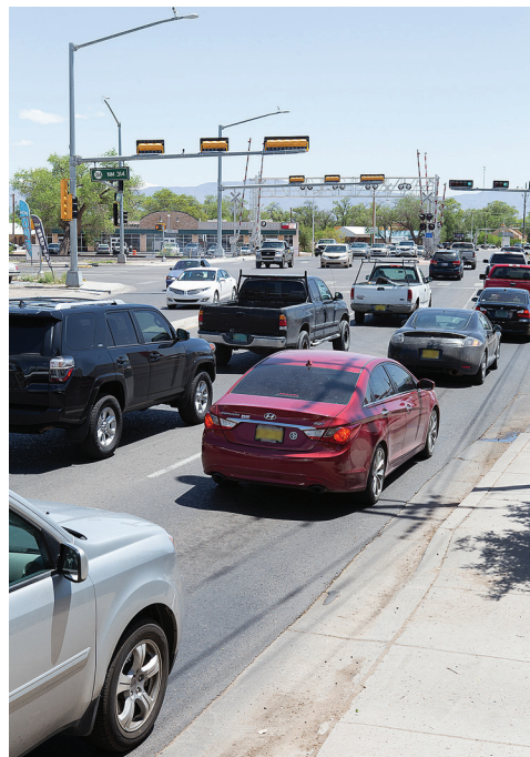
Traffic on Main Street/NM 6.

Then it continues eastward with a new bridge over the Rio Grande and a new intersection at NM 47.