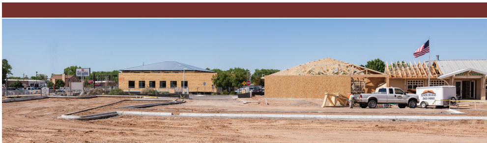
Lots of construction continues near the recycling area on Don Pasqual so be careful when in that vicinity.

Contact Endeavor Safety Rescue Inc. for details. 505 565-EDVR (3387).