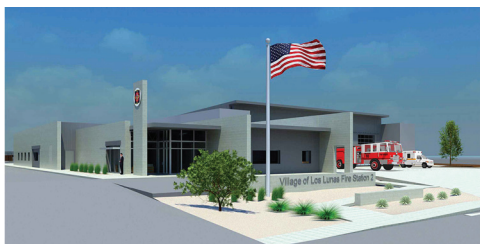
Village Fire Station #2

Funding for the station comes from a $5.8 million mill levy approved by Village voters in March 2016.