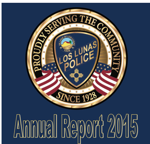
LLPD Police report now available