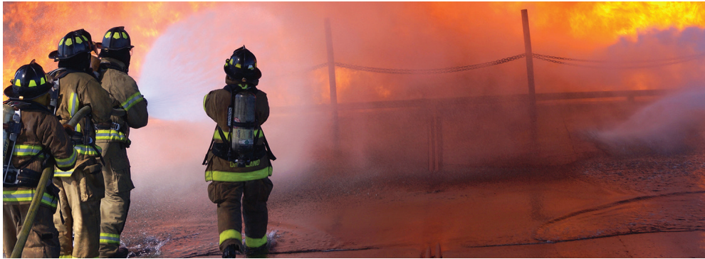
A LESSON PREVENTING FIRE

For more information contact the fire department at 866-2116 or check out the Village Fire Department page on the Village website, loslunasnm.com .