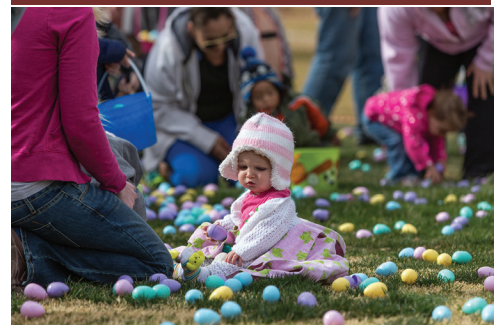
Kids had a good time finding eggs during the Village egg hunt.

Museum of Heritage & Arts 251 Main St. SE 505 352-7720 Under the Water Tower 10 a.m. – 5 p.m. Tues-Sat