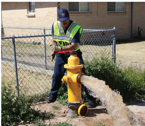
Village worker flushes fire hydrant

Residents in the immediate vicinity of the work may experience temporary water discoloration. This discoloration consists of harmless silt and precipitates and does not affect the water's safety.