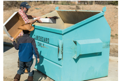
Families brought items for recycling