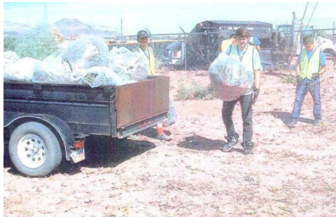
Summer youth workers pick up trash as they clean up around the Village