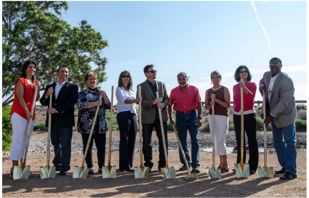
Groundbreaking for the Interchange Beautification Project commenced at a ceremony hosted by Mariscos Altamar on August 20, 2015.

The Village has also partnered with Molzen Corbin, Roddick & Dunbar