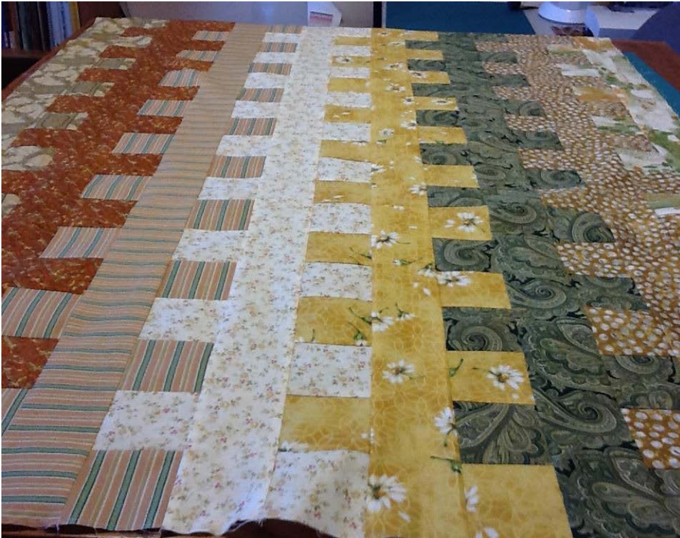
Gathering Stitches is a popular local shop for quilters in the Village of Los Lunas.