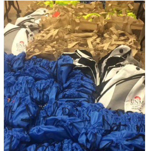
Los Lunas PD put together 469 backpacks filled with school supplies donated by the community.