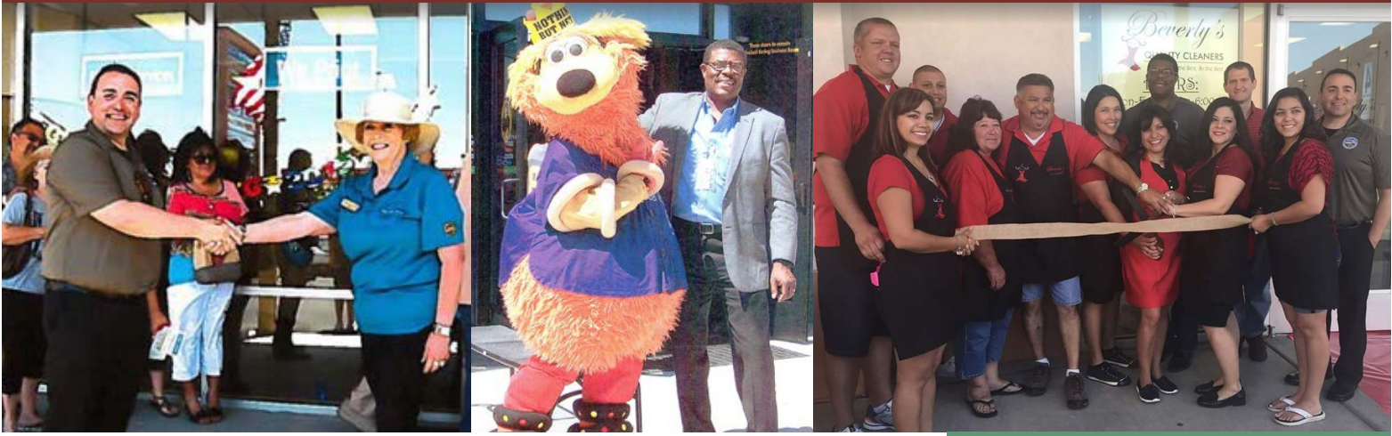
New Los Lunas businesses from left to right: UPS Store, Buffalo Wild Wings, Beverly's Quality Cleaners.