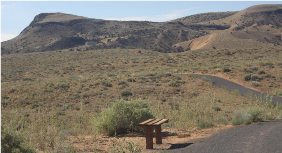
A bench to rest on and a wide smooth path are among the features of the trails at El Cerro de Los Lunas.