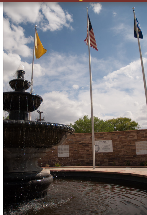
Main Street Memorial Park in Los Lunas, New Mexico

More information about the program is available by contacting the Williamson Foundation at 505-814-7800, which is partnering with Honor Flight Network, or online at honorflight.org .