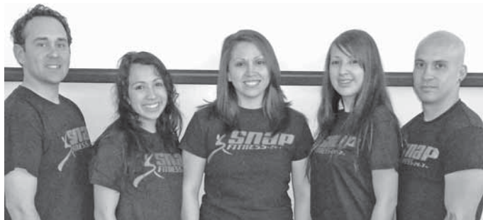
The trainers at Snap Fitness look forward to seeing you.

The Snap Fitness trainers point out that there's no miracle diet for being healthy. Regular workouts with resisted weight and cardio training paired with eating properly is what's needed.