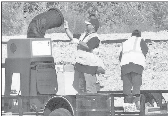
A worker puts glass into a grinding machine which helps recycle that glass during the August recycling event sponsored by the Village's Keep Los Lunas Clean and Beautiful.