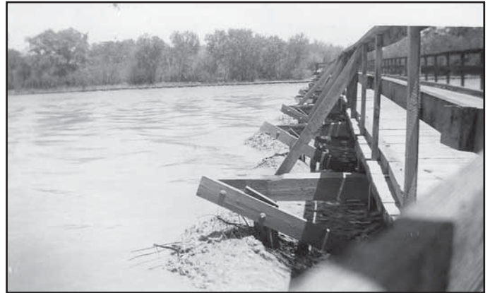
1950 photo of the Los Lunas Bridge over the Rio Grande