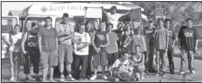
Youth workers/supervisors on last day of work.