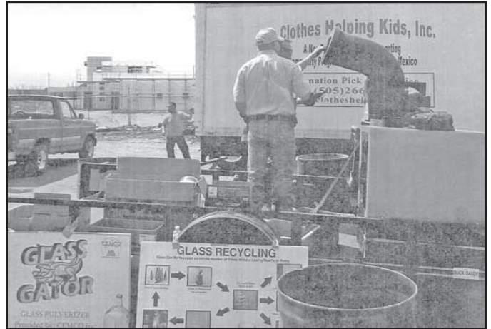
An employee of Cemco Glass puts glass in the crushing machine during the village's Great American Recycling Day Event.