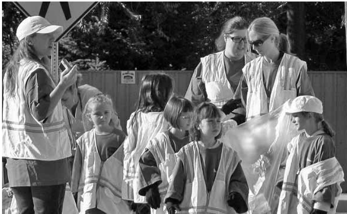
Trek for Trash participants prepare to clean up Los Lunas last month.

Grandin Testing Lab, Inc., Weck's Restaurant, Bosque Auto Body, Days Inn, Raks Building Supply, Inc., Pepsi Cola Bottling Co., Dion's Pizza, Walmart, Ortega's Plumbing & Heating, Inc., Western Skies Inn & Suites, Tai's Chinese Restaurant, Nail's Spa, Smith's Food & Drug Store, Fox Electric, Jer's Magic Carpets Coffee Shop Los Lunas, and Benny's II.