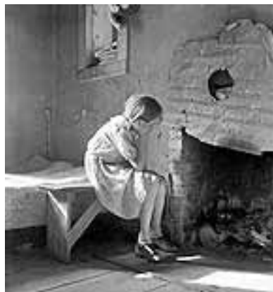
Dorothea Lange: Resettled farm child from Taos Junction to Bosque Farms project, New Mexico. Photography for the Farm Security Administration, December 1935. U.S. Library of Congress

A look at the famed Route 66 that came through Los Lunas and the effects of The Depression on Valencia County, New Mexico, and Our Nation.