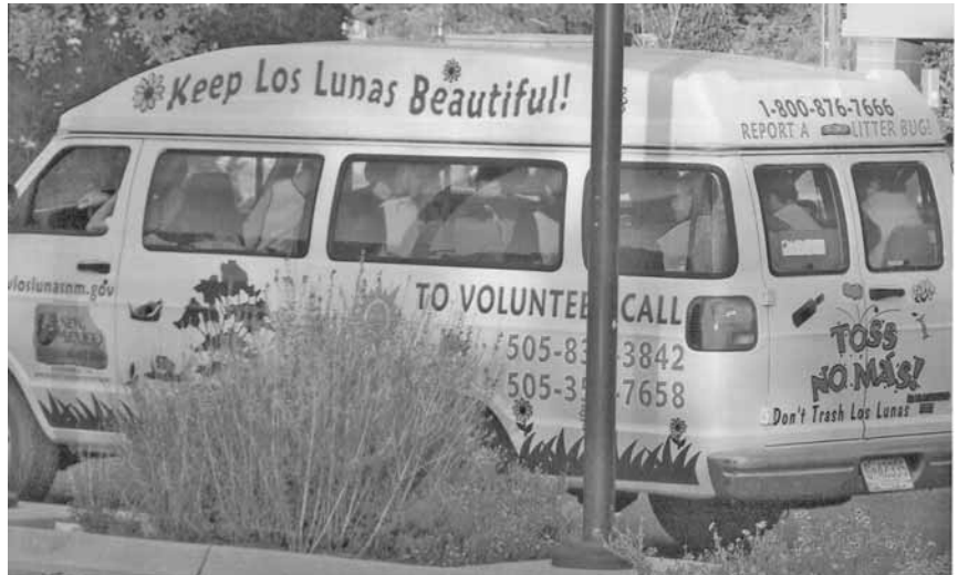
Trek for Trash volunteers rode in the recently decorated Keep Los Lunas Beautiful van.

The agenda will be available at least twenty-four (24) hours prior to the scheduled meeting from the bulletin board in the lobby of the Administration Building, at 660 Main Street NW, Los Lunas, NM; the Los Lunas Library located at 460 Main Street NE; and posted on the village website (address: www.loslunasnm.gov ).