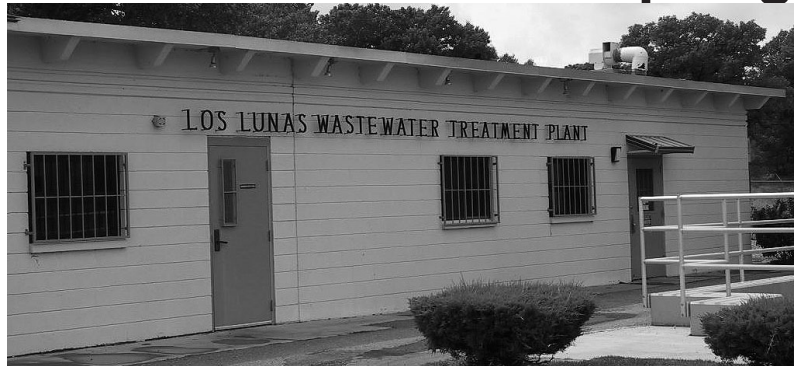
The current wastewater treatment plant building which holds the offices and lab.

The village's wastewater treatment plant, which came on line in 1983, was upgraded in the mid 1990s.