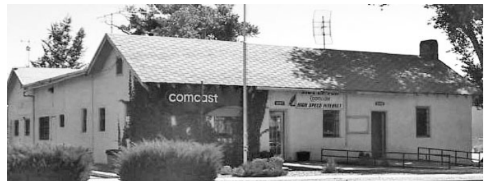
The Archuleta building, located on the southwest corner of Main Street and Luna Avenue, is about to undergo rehabilitation. See page 2 for the story about that and the expansion of the village administration building.